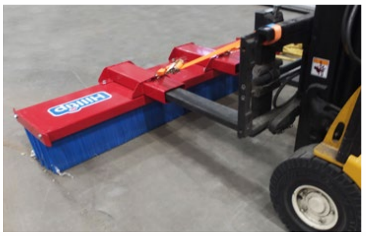
\textit{SweepAway}^{\text{\tiny{TM}}} \ \textit{with attachment for forklift}