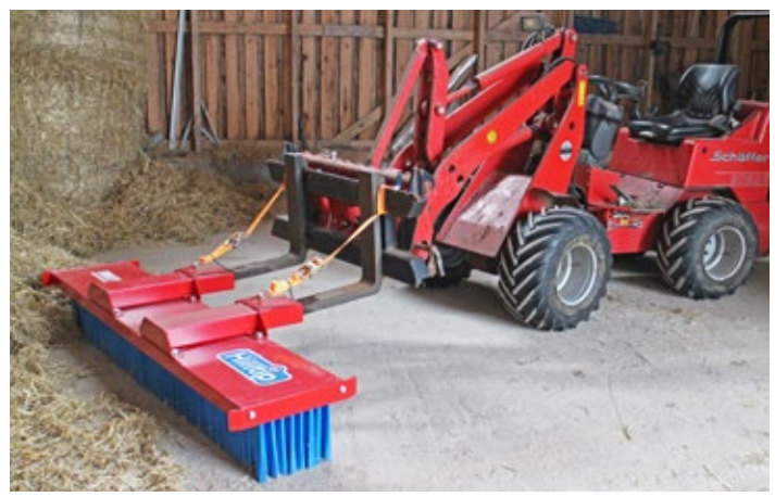
The SweepAway ^{\text{TM}} can handle a variety of materials, such as leaves, sand, rocks, debris, snow, slush etc.