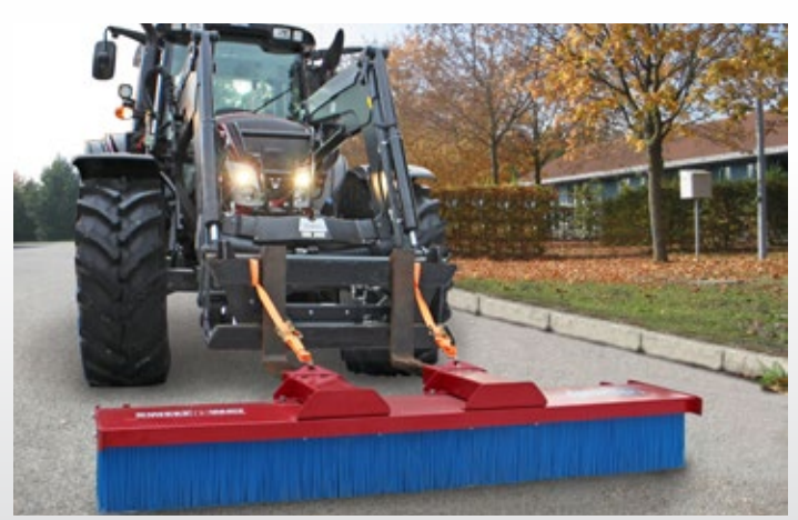
SweepAway™ medium series, with 12 brush rows