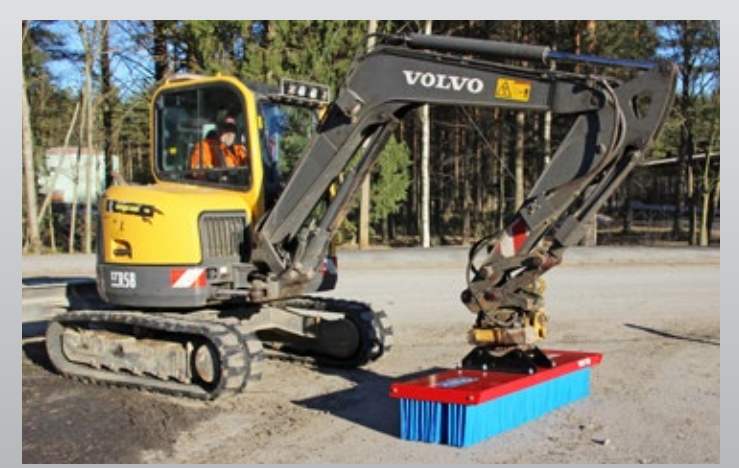
SweepAway™ on excavator