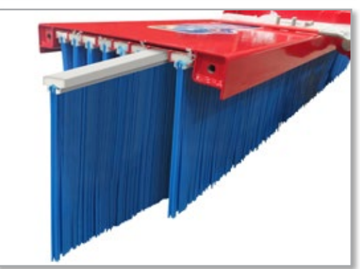
Replacing the brush rows is quick and easy