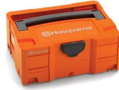
Accessory for Floor grinders