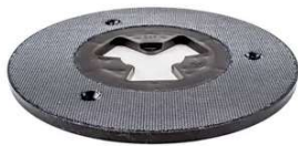
Accessory for Floor grinders