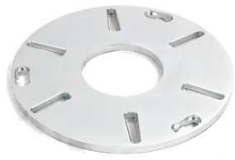
Accessory for Floor grinders