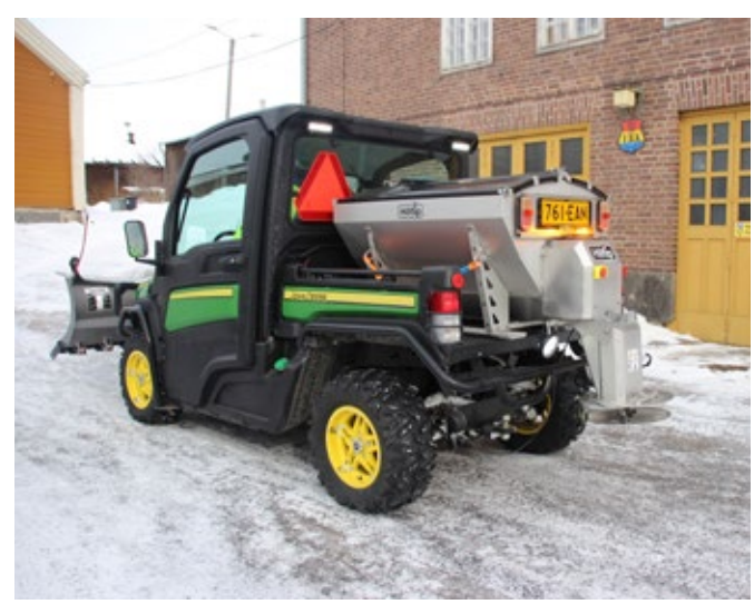
IceStriker™380 on UTV

The high quality stainless steel hopper body guarantees a longlasting corrosion-free use. The hopper surface is easy to clean and maintain, and provides a smooth material flow. The spreader is designed for spreading bulk sand and gravel, bulk/ bag salt, sand-salt mixes and fertilisers. Can optionally be equipped with pre-wet kit.