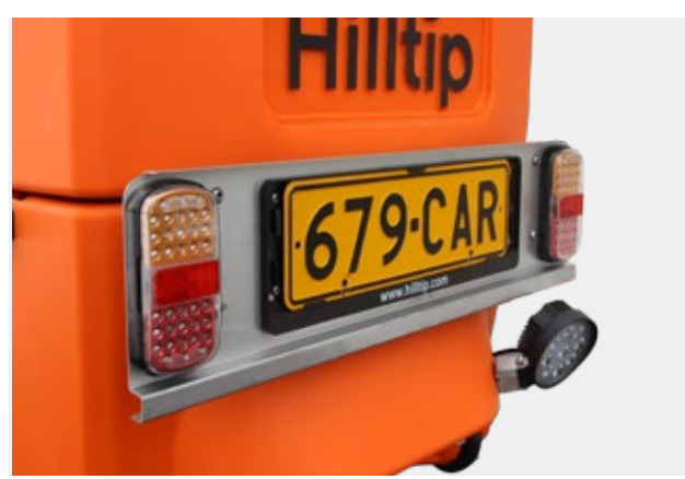
LED rear lights, license plate kit and LED work light