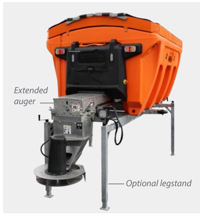
IceStriker<sup>™</sup> 2100 in the optional color orange