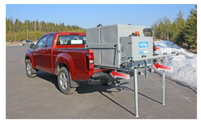
Optional legstand and sliding-tracks on truck bed for easy installation and removing of sprayer.