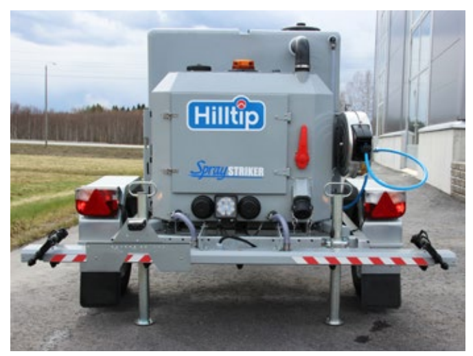
SprayStriker<sup>™</sup> 500 with support legs

The liquid de-icing trailer is the most efficient electric liquid sprayer on the market with the capability of spreading 20 ml / m<sup>2</sup> with the speed of 25 km / h and spreading width 2 m. The maximum spreading width is 5 m, by the optional spraybar end nozzles.