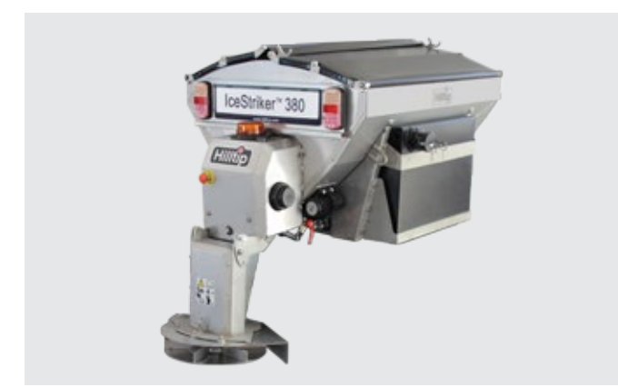
IceStriker<sup>™</sup> 380 with pre-wet salt liquid kit, nozzles, pump with built-in tanks in spreader construction