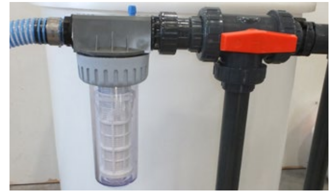
Heavy duty filter and 3-way valve