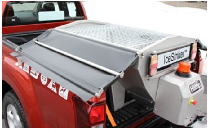
Tarp cover and top screen