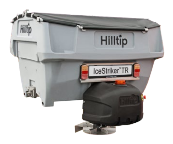
IceStriker ™ 600TR-1000TR

The Hilltip IceStriker<sup>™</sup> TR-model is a 630-1050 liter salt and sand spreader with polymer hopper and mounted parts in stainless steel that gives you effective protection against rust and corrosion. This unique all-in-one spreader also includes integrated tanks for the optional liquid systems.