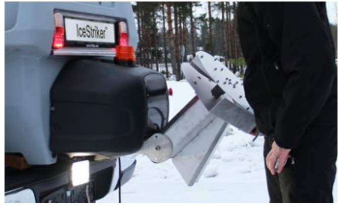
Stainless steel flip-up chute, designed for spreading salt with high humidity