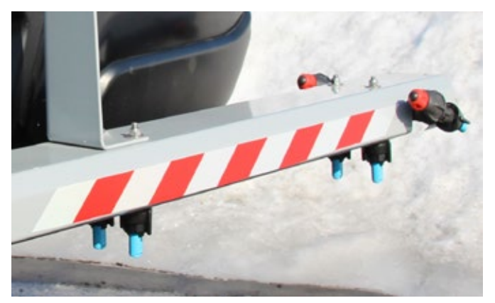
Double spray nozzles for de-icing even in high speeds.