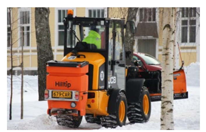
Optional color: orange