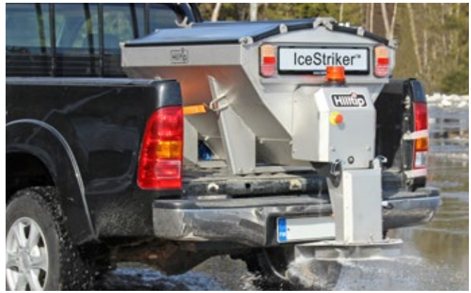
Spreading width up to 8 meter