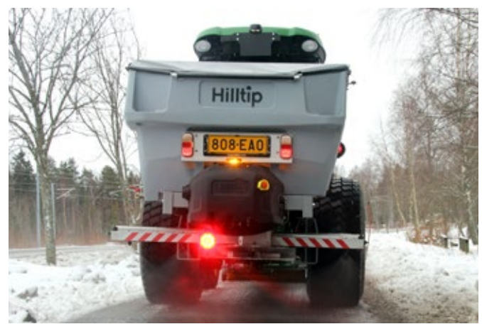
Led work light (red) and beacon light (orange)