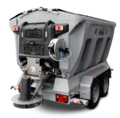
Towable Icestriker<sup>™</sup> 1600