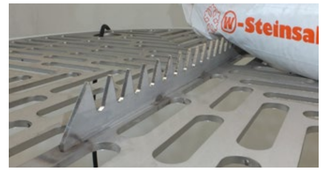
Sharp edge to cut bags