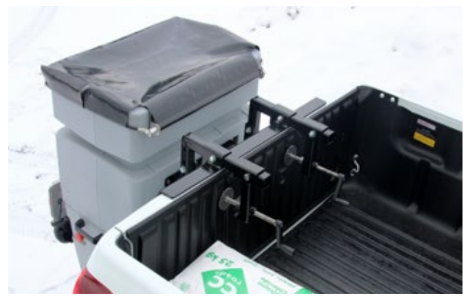
Pickup Tailgate mount