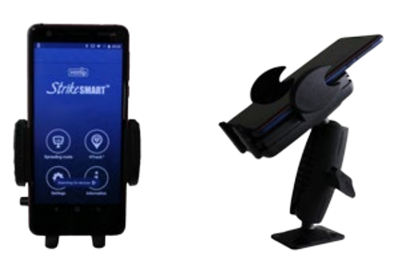
Smartphone controller holder